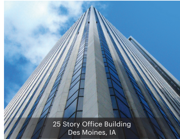
25 Story Office Building Des Moines, IA